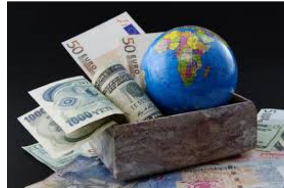
UNDERSTANDING CURRENT ECONOMIC ENVIRONMENT (CONTEXT)