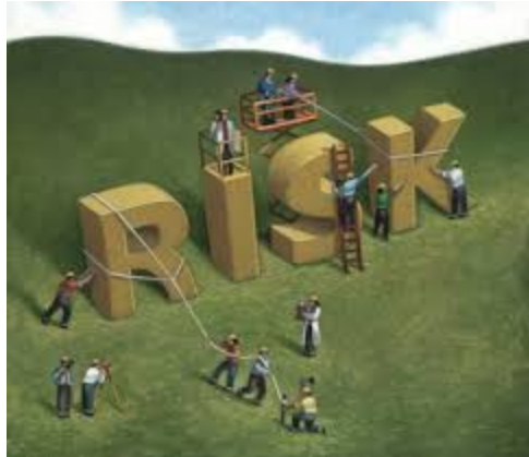
ROBUST RISK ASSESSMENT